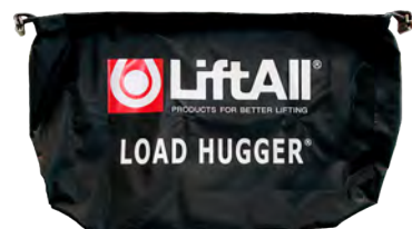
Logistic Strap Storage Bag Part Number 60820