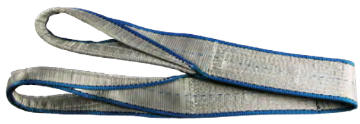
Type 3 - Flat Eyes

Tapering Eyes - As a standard, the bearing points of the eyes on Type 3 and Type 4 slings 3" and wider are tapered to accommodate a crane hook. Untapered eyes are available upon request. Type 5 (endless) slings are NOT tapered unless specified on order. Dura-Web™ 2000 slings are NOT tapered in any width.