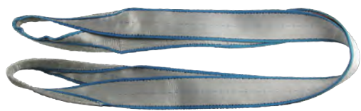
Type 5 - Endless (Showing Taper)